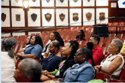
Teamwork Englewood and Imagine Englewood If hosted the first Behavioral Health Summit, offering residents supportive sessions on healing, trauma, and wellness, while creating a safe space for connection, growth, and community care.