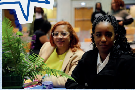
EQLI's 2025 Business Brunch brought Englewood entrepreneurs together to share insights, address challenges, celebrate growth, and strengthen partnerships shaping the future of local economic development.