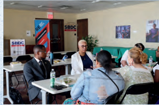
Teamwork Englewood welcomed nine new organizations to the Englewood Women's Initiative, empowering women ages 18-45 with job readiness, digital literacy, resume support, and career pathways, helping build stronger careers, families, and futures in the community.